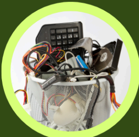
ELECTRONICS & WIRING ✓