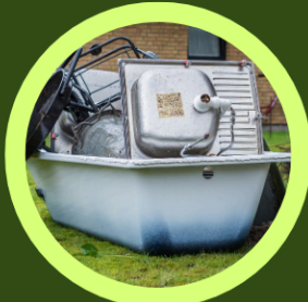
APPLIANCES & SCRAP METAL ✓