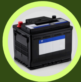
CAR BATTERIES ✓